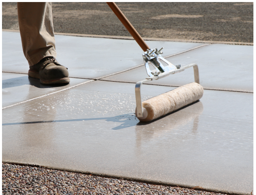
Roll it in