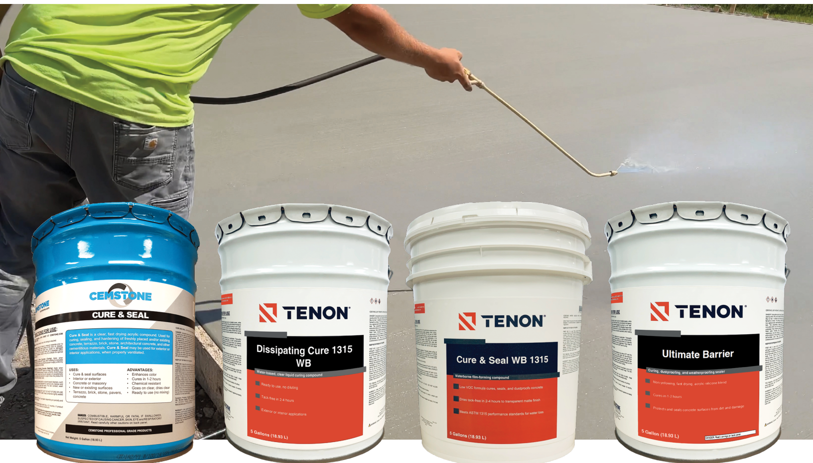
Cure & Seal