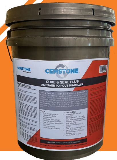
Cure & Seal Plus

ASR (Alkali-Silica Reactivity) occurs when alkalis (potassium and sodium) from Portland cement react with certain siliceous aggregates. When this reaction occurs, a gel is formed. In the presence of moisture, the gel expands causing internal pressure which often leads to surficial sand pop-outs. These sand pop-outs predominately occur in high evaporation rate conditions. When ACI 305 hot weather conditions exist and there is the possibility of ASR sand pop-outs, apply Cemstone Cure & Seal Plus "ASR Sand Pop-Out Minimizer" immediately after final finishing is completed.