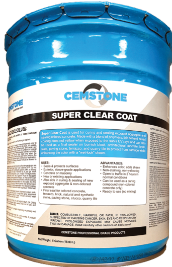
Super Clear Coat