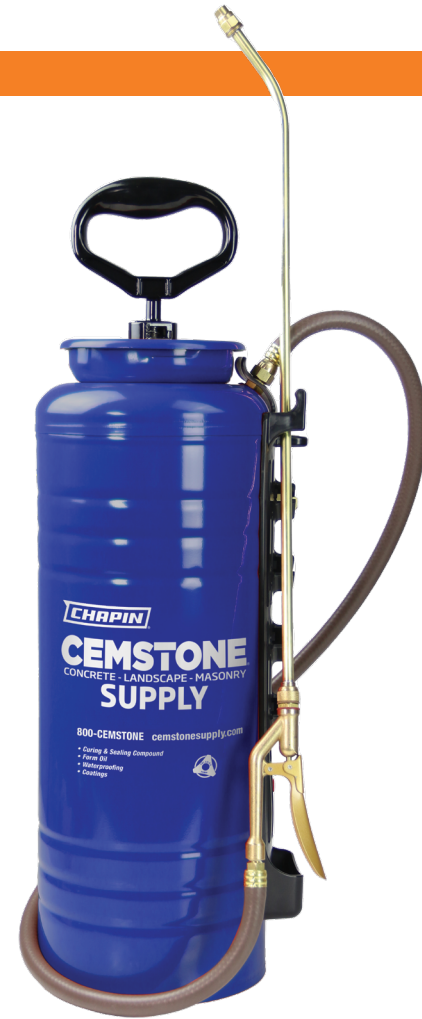
Cemstone Chapin Sprayer