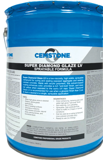
Super Diamond Glaze LV