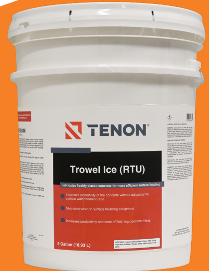
Trowel Ice RTU (Ready to Use)