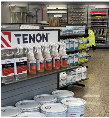
Professional Grade Product Selection