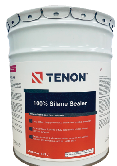
100% Silane Sealer