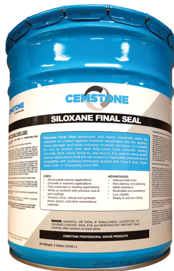
Siloxane Final Seal