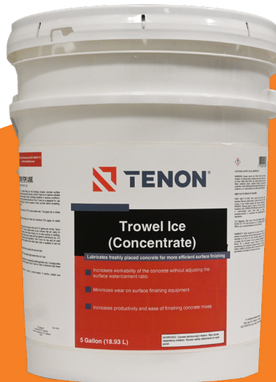
Trowel Ice (Concentrate)